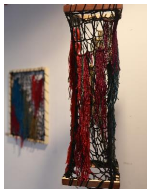
Figure 2 Spatial interior decoration made of cut T-shirts and old sweater [6]